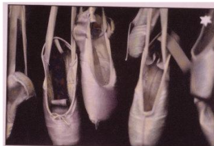
Hanging Pointe Shoes.